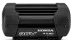
36V 4.0Ah DP3640XA

A selection of Honda universal Li-ion batteries for the cordless range.