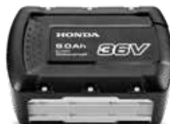
36V 9.0Ah DPW3690XA