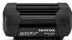
36V 6.0Ah DP3660XA